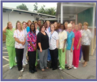
Family Advocate Staff work hard to assist our families all during the year.