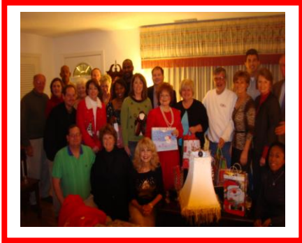
Members of Leadership Waycross Alumni collected gifts at their annual Christmas Party. They have donated gifts to Head Start for over 10 years!

Children chosen to receive gifts were identified by the Family Advocate staff based on home visits and documented need. Thanks to the many individuals and groups that gave so generously to make the holidays brighter for our families.