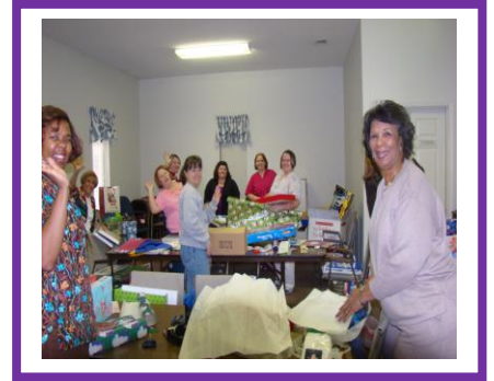
The Waycross Bar Association adopted 20 children - including siblings of our Head Start and Early Head families. Staff enjoyed assisting wrapping gifts.