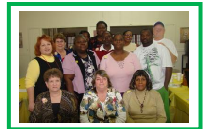
Participants pose for their official Grand.NET graduation photo.

TO PROVIDE A QUALITY TEACHING AND LEARNING ENVIRONMENT TO MEET THE DEVELOPMENTAL NEEDS OF ALL CHILDREN TO ENSURE FUTURE EDUCATIONAL SUCCESS.