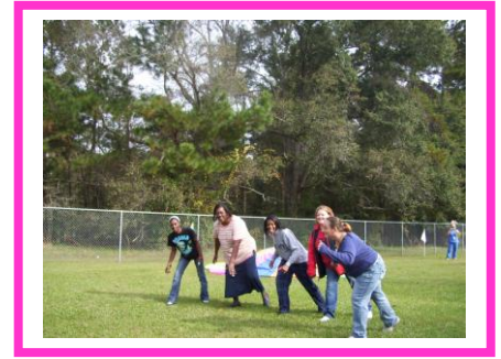
Parents race to the finish line during the “Turkey Trot” held at the Appling County Head Start Center.

CSI Child Development Services incorporates physical activity and parent involvement as part of the “I am Moving, I Am Learning curriculum.”