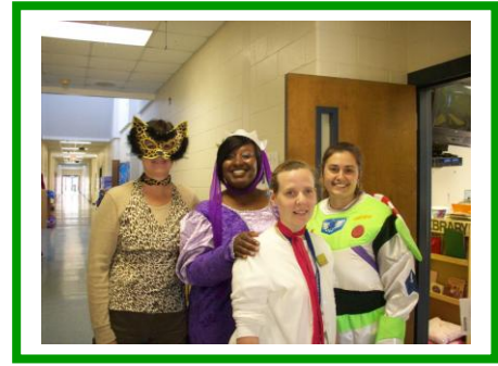
Staff from Clinch County dressed up as part of “Costume Day.”

Thanks to all the staff for making Red Ribbon Week so special!