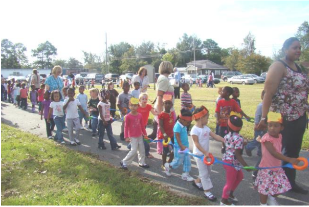
Children, staff, parents and volunteers join the first annual Head Start Walk-a-Thon event.