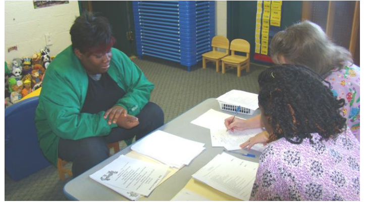
Parent orientation training helps the parent and child transition into the program. The staff take the opportunity to welcome the parents into the center and complete necessary paperwork.