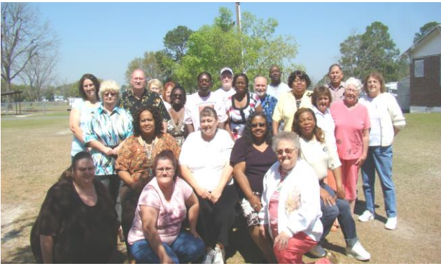
Grand.Net graduation picture spring 2010.