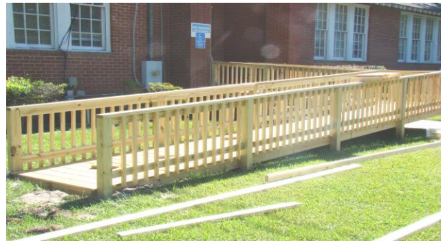
ADA ramp at Appling County is built with AARA quality improvement funds.

Enrollment increased by 100 Early Head Start slots this program year. The program was notified in December 2009 of the grant award and while we awaited official documentation we contacted our local Board of Education partners of the funding. Due to the winter holiday season, it was January 6, 2010, before the first placement of children funded under this grant award could be place. Due to minor repairs, hiring staff, training staff, recruitment for enrollment to target population and other items that needed coordination, all other slots were filled by mid-March.