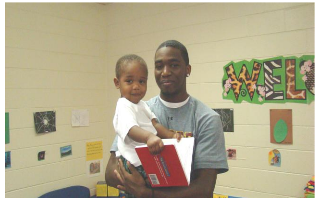
The program puts emphasis on male involvement at the center and at home.

C onstruction is almost completed on the Hazzard Hill CDBG (Community Development Block Grant) Project in Waycross. This is a partnership project with the City of Waycross. The building will house five Early Head Start classrooms and the McKinney Health Clinic. Construction completion is projected for October 2010.