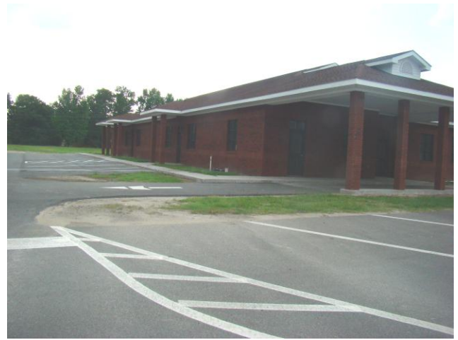
Hazzard Hill EHS Center in Ware County is almost ready for the big move.

C onstruction is almost completed on the Hazzard Hill CDBG (Community Development Block Grant) Project in Waycross. This is a partnership project with the City of Waycross. The building will house five Early Head Start classrooms and the McKinney Health Clinic. Construction completion is projected for October 2010.