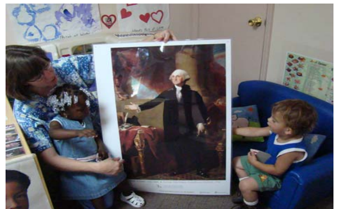
Picturing America program in partnership with the National Endowment for the Humanities