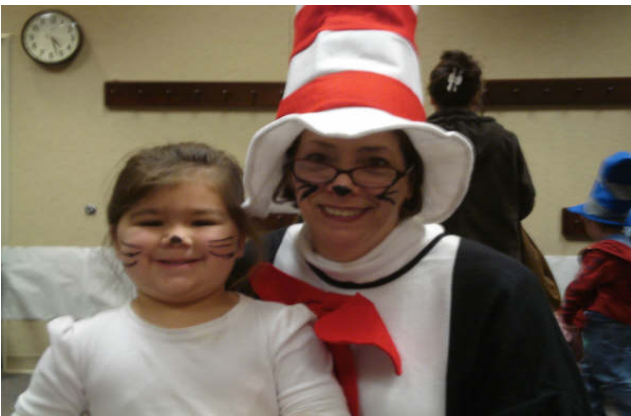
Dr. Seuss' Birthday Celebration at the Public Library