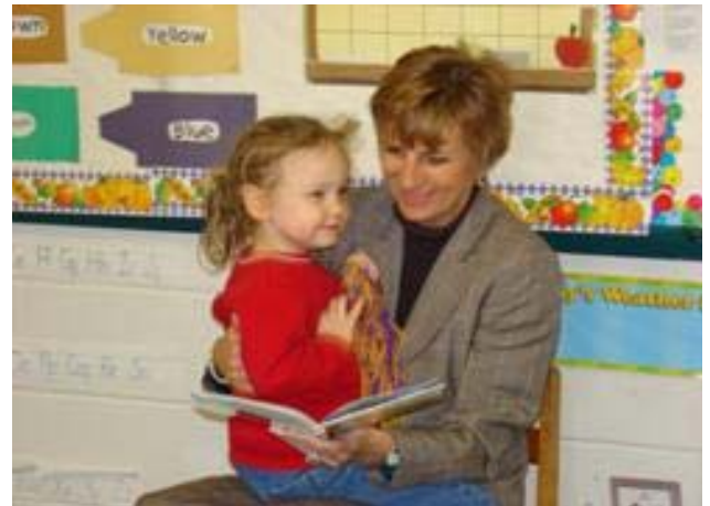
Member of community groups reading to children