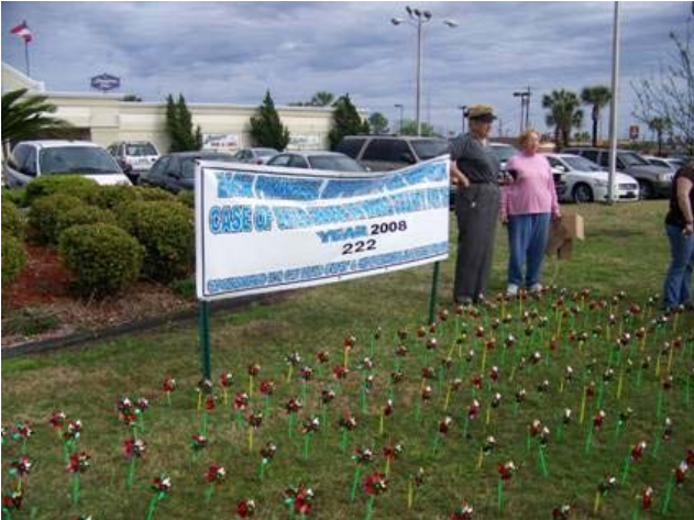
Pinwheel Child Abuse Awareness Campaign