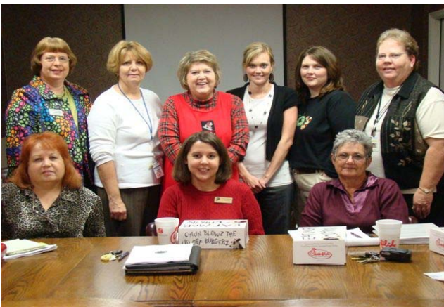
Partnership meeting with local Board of Education Homeless Coordinators